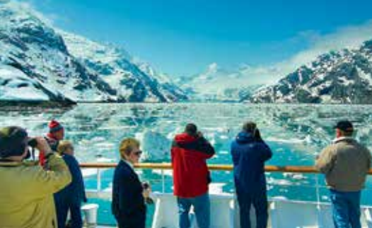
Be on deck while cruising the spectacular Inside Passage.

RESPONSIBILITY: Trustees of Tufts University, The Tufts University Alumni Association, Tufts Travel-Learn Program, and Gohagan & Company, and its and their employees, shareholders, subsidiaries, affiliates, officers, directors or trustees, successors, and assigns (collectively "Gohagan"), do not own or operate any entity which is to or does provide goods or services for your trip including, for example, lodging facilities, airline, vessel, or other transportation companies, guides or guide services, local ground operators, providers or organizers of optional excursions, food service or entertainment providers, etc. All such persons and entities are independent contractors. As a result, Gohagan is not liable for any negligent or willful act or failure to act of any such person or entity or of any other third party.