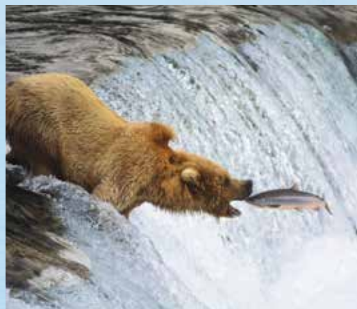
Observe graceful brown bears catching wild salmon.

Explore the rich Tlingit culture while conversing with local artisans in Sitka National Historical Park, where trails are lined with