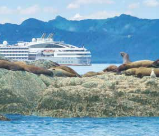
d seals, also known as ice seals, at rest on rocks.

towering totem poles, a lasting memorial to an ancient artform. Marvel at the priceless collection of icons in the onion-domed St. Michael's Cathedral, North America's first Russian Orthodox church.