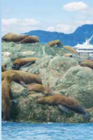
Visit Elfin Cove and look for ringed seals