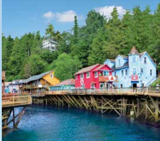
Stroll the gold rush-era boardwalks of Ketchikan's Creek Street, and look for salmon swimming upstream.

The Alaskan state capital, accessible only by air or sea, picturesque Juneau is where The Call of the Wild author Jack London set forth to join the Klondike Gold Rush in 1897.