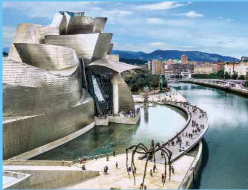
Bilbao's avant-garde Guggenheim Museum is wrapped in shining waves of titanium.

While cruising the dramatic west coast of France, attend an exclusive lecture on board by David Eisenhower .