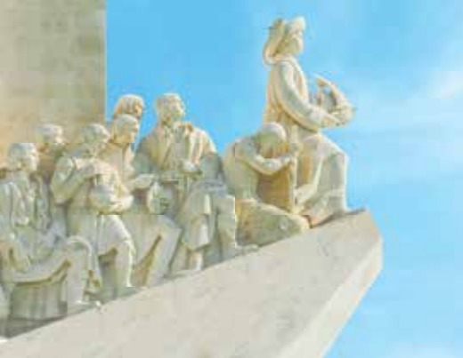
Lisbon's Monument of the Discoveries surveys the Tagus River's port and celebrates the Age of Exploration.