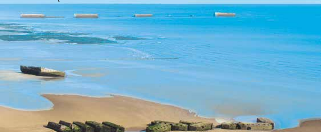
Remnants from D-Day are still visible at man-made Mulberry Harbor, including anchored "Beetle" pontoons.