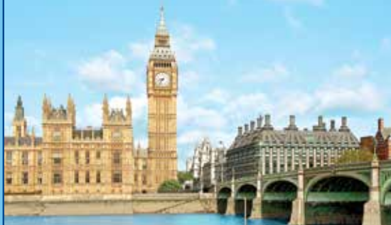
The Parliament, neighbored by 19 th -century Big Ben, was strategically built on the Thames River in 1016.

Resplendent palaces, magnificent churches and pastel-hued houses stand in testament to Lisbon's rich cultural heritage and quintessential charm. A historic gateway for world exploration and Portugal's intimate, welcoming capital, Lisbon is the ideal prelude to your cruise. Visit the UNESCO World Heritage sites of 16 th -century Jerónimos Monastery and the nearby forested village of Sintra, where the former Moorish fort is Portugal's last remaining medieval royal palace. Accommodations are for two nights in the deluxe DOM PEDRO PALACE HOTEL.