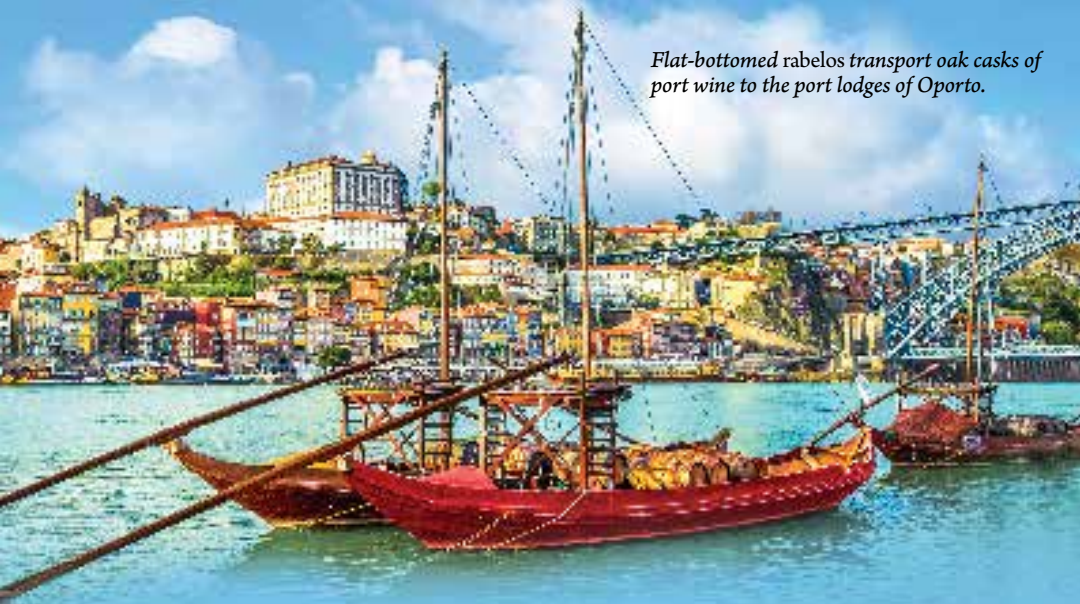
Flat-bottomed rabelos transport oak casks of port wine to the port lodges of Oporto.

At Pointe du Hoc, envision the heroic U.S. Army Second Ranger Battalion scaling this cliff promontory, and survey the serene English Channel. Then, contemplate the solemn commemorative crosses and Stars of David in the American Military Cemetery at Colleville-sur-Mer.