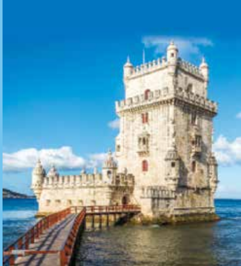
From the iconic 16 th -century Tower of Belém, in the Tejo Estuary, watchmen surveyed Lisbon's harbor.

enshrines the tomb of St. James and is recognized for its Baroque façade, original medieval portico and glittering Churrigueresque altar.