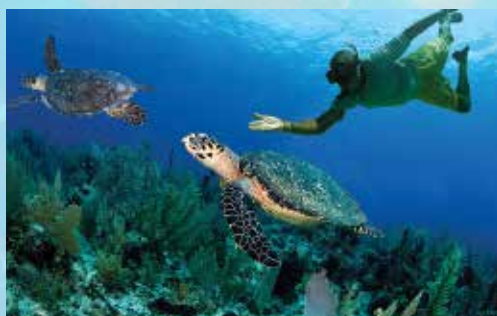
Snorkel among peaceful hawksbill sea turtles in the clear-blue waters of the Grenadines.

From the veranda of a Creole farmhouse in the famous Balata Gardens, watch effervescent hummingbirds feed on sweet nectar.