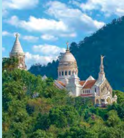
Martinique's Sacré Coeur is the miniature twin of its sister hilltop church in Paris.

is an underwater gallery of colorful sponges, conchs, sea turtles and reef fish.