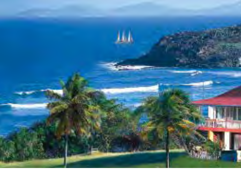
Bequia's protected natural harbor is the perfect haven for sailing ships.

RESPONSIBILITY: Trustees of Tufts University, The Tufts University Alumni Association, Tufts Travel-Learn Program, and Gohagan & Company, and its and their employees, shareholders, subsidiaries, affiliates, officers, directors or trustees, successors, and assigns (collectively "Gohagan"), do not own or operate any entity which is to or does provide goods or services for your trip including, for example, lodging facilities, airline, vessel, or other transportation companies, guides or guide services, local ground operators, providers or organizers of optional excursions, food service or entertainment providers, etc. All such persons and entities are independent contractors. As a result, Gohagan is not liable for any negligent or willful act or failure to act of any such person or entity or of any other third party.