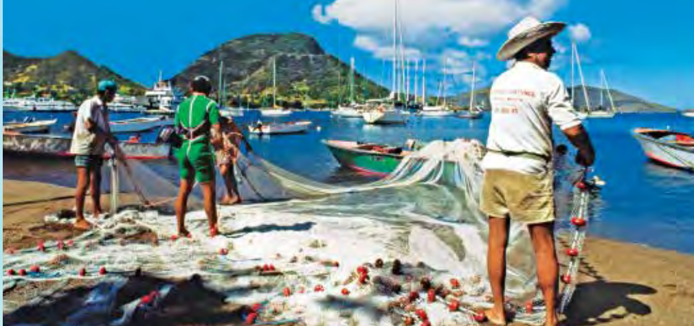
Island fishermen ready their nets for catching some of the most popular fresh fish in the Caribbean.

a French historical landmark and producer of Clément rum for more than 125 years. Tour the former distillery and see galleries that highlight local Caribbean artists and Creole heritage. Stop in the manor house, notable as the site of the 1991 post-Gulf War meeting between French President François Mitterrand and U.S. President George H. W. Bush.