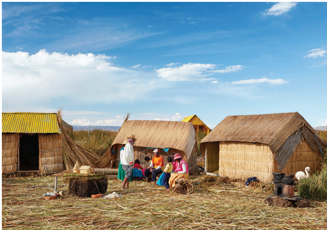
Uros Islands residents on Lake Titicaca

Aguas Calientes and our hotel, with time at leisure before dinner together tonight. B,L,D