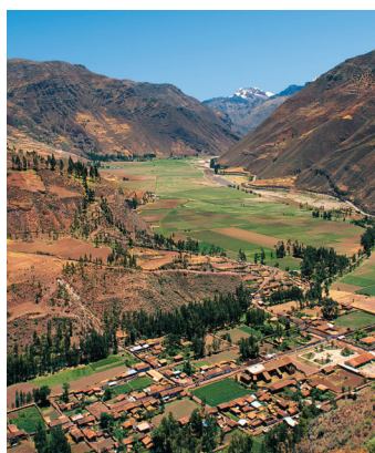
The beautiful and historic Sacred Valley

horizon farther. By boat we visit the Floating Islands of Los Uros, where the top-hatted Uros people live on “islands” made of the reeds that grow in the lake’s shallows; in fact, the Uros rely on these reeds for their boats, the small huts in which they live, household items, and the handcrafts they sell to visitors. We also visit Isla Taquile, known for the high-quality textiles crafted by the indigenous people who live here; sales of their textiles support the self-sustaining Taquilenos. On our visit, we see the men in their signature woven