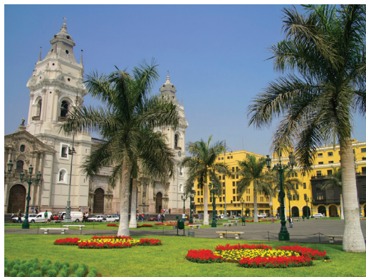
Lima’s Plaza Mayor

On this program, a Tufts University faculty host will present lectures and lead discussions that will enhance your educational experience. As this brochure goes to press, the faculty host who will accompany the program has not yet been confirmed, but we wanted to mail this brochure in time for you to make plans to participate.