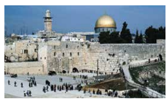
Devout Jews pray at Jerusalem's Western Wall.

Day 12: Depart Tel Aviv for U.S. Very early this morning we transfer by motorcoach to Tel Aviv for our connecting flights to the United States. B