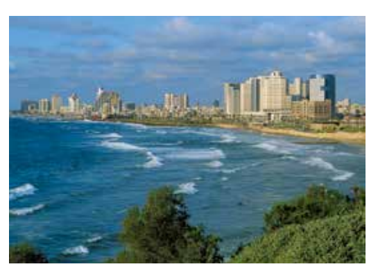
Sophisticated seaside Tel Aviv

On this program, we expect a Tufts faculty host to join you to present lectures and lead discussions. However, if due to low enrollment it is not possible to send a Tufts lecturer along, please be assured that our partners at Odysseys Unlimited share our belief that travel should provide an opportunity to learn about the world around us in a deep and meaningful way. We are confident that they will provide you the learning opportunities we know our travelers cherish.