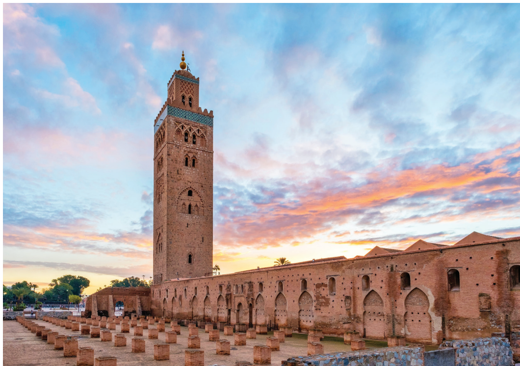
We see the distinctive Koutoubia Mosque – Marrakech’s largest – on Day 11.

Day 6: Fez We begin today with a walk through the medina and a visit to the Al-Attarine Madrasa, whose highlight is a small courtyard showcasing intricately detailed tilework and carving decorations. Then we embark on a walking tour of the medina focusing on the artisans’ quarters, the 14 th -century Koranic schools, and Al Karaouine, the medieval theological university. After lunch on our own, we visit the Borj Nord Arms Museum, an authentic Saadi fort that dates from 1582 and one of Morocco’s only European-influenced forts. After exploring the Moroccan armaments here, we are free this afternoon for independent exploration or relaxation. Tonight, we enjoy a private dinner at an intimate family-run riad in Fez. B,L,D