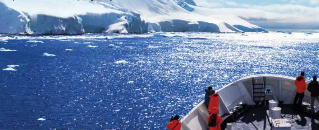
Photo this page: Enjoy the calm waters and surreal beauty of captivating glacier-lined Lemaire Channel, first traversed in 1898 by Belgian explorer Adrien de Gerlache.

Cover photo: Expert-led Zodiac excursions offer up-close viewing of craggy crescent peaks, intricate ice floes and distinctive wildlife that thrives in the extreme conditions of this remote Antarctic landscape.