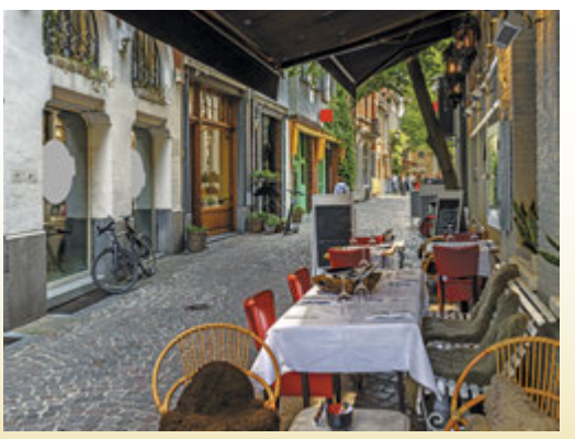
Old Town, Antwerp

Tonight, share in a festive Farewell Reception and Dinner to commemorate your journey.