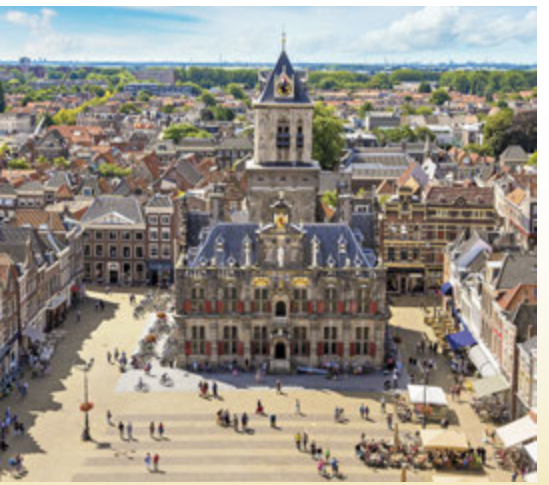
Top: Cathedral Square, Antwerp | Above: Old Town, Delft

Discovery: Antwerp. Located on the Scheldt River near the North Sea, Antwerp boasts a rich legacy as a prominent seaport and center of trade. More recently, it has become a fashion design hub. On a guided walk, appreciate its