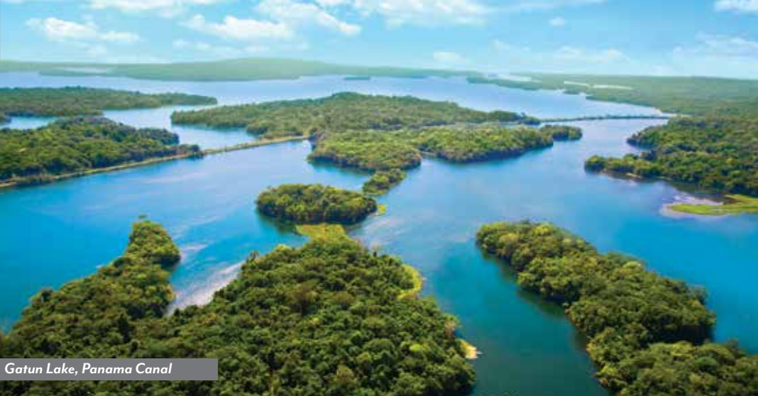
Gatun Lake, Panama Canal