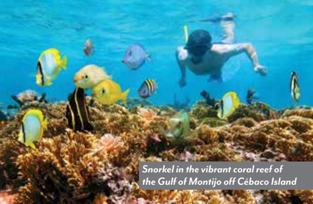
Snorkel in the vibrant coral reef of the Gulf of Montijo off Cébaco Island