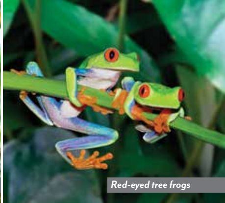
Red-eyed tree frogs