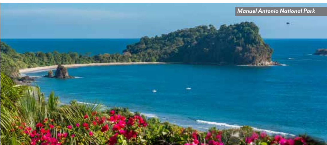
Manuel Antonio National Park

Transfer to Panama City for your return flight home.