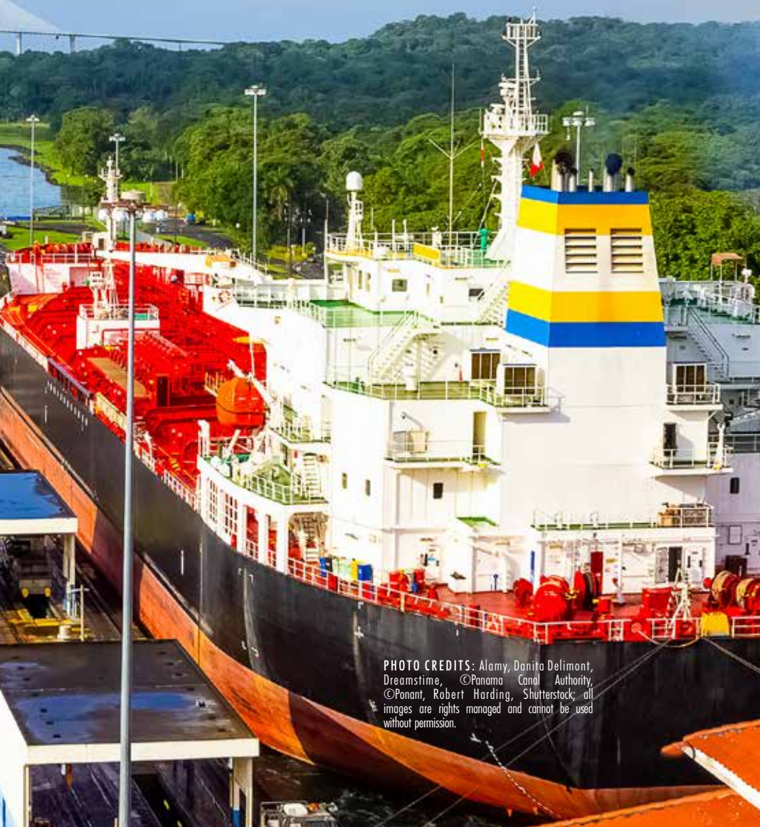
PHOTO CREDITS: Alamy, Danita Delimont, Dreamstime, ©Panama Canal Authority, ©Panant, Robert Harding, Shutterstock; all images are rights managed and cannot be used without permission.