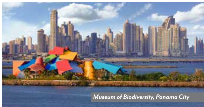
Museum of Biodiversity, Panama City

In the sparkling Gulf of Montijo, snorkel in the emerald waters of seldom-visited Cébaco Island, where schools of brilliantly colored fish, giant manta rays and four different species of turtles swim amid spectacular rock reefs.