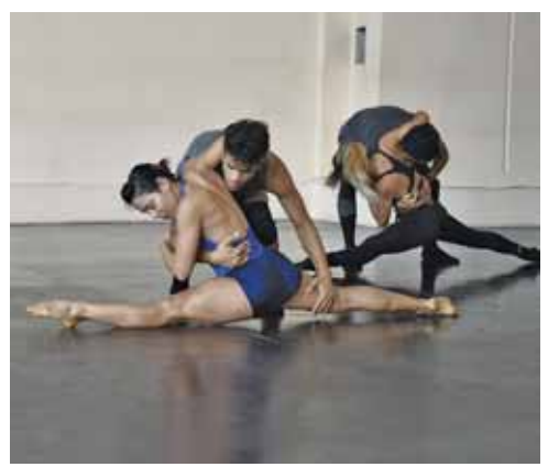
Contemporary dance studio, Havana

Enrichment: Race and the Cuban Revolution. Discuss the effect of the Cuban