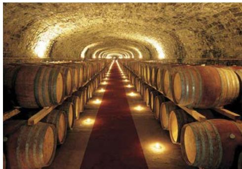
Castello di Monsanto wine cellar

Discovery: Siena. Feel the warmth of storied Siena, the Middle Age gem known for its rosy-pink hue. A guided tour takes you to see the acclaimed, shell-shaped Piazza del Campo; the Torre del Mangia, Siena's iconic bell tower; and Fonte Gaia, the Joyful