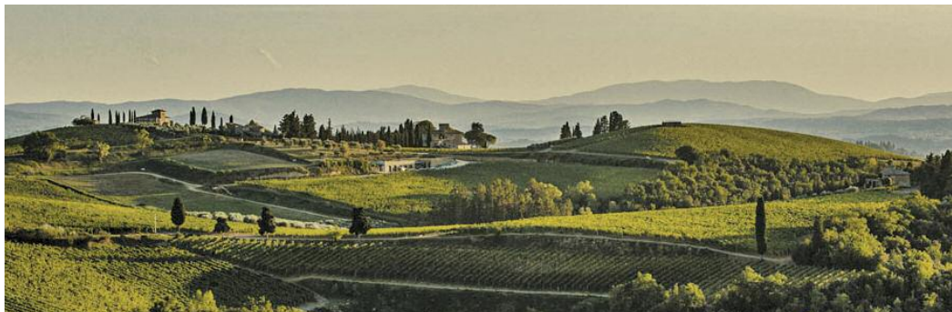
Top: Ponte Vecchio spanning the River Arno | Above: Castello di Monsanto

Enrichment: Renaissance Art. Gain greater insight into Renaissance art during an expert lecture. Ponder the artists' shift to realism,