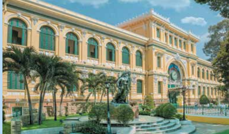
View Saigon's striking, well-preserved, neoclassical Central Post Office opened in 1891 and Vietnam's largest post office.