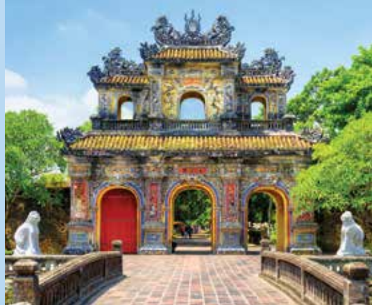
Pass through the beautiful Hien Nhon Gate of Hue's monumental Imperial Citadel.

Tour the Temple of Literature where scholars have studied Confucianism since A.D. 1070. Visit the Hoa Lo Prison Museum, "Hanoi Hilton," which held captured pilots during the Vietnam War. Stroll the historic 36 Streets of the Old Quarter, named after the skilled craftspeople that worked here.