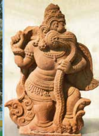
See Da Nang's excellent collection at the Museum of Cham Sculpture.

where women still wear the traditional áo dài , a silk tunic worn over pantaloons. See the neo-Romanesque-style Notre Dame Cathedral and the City Opera House, both a distinct reminder of the city's French Colonial history. Visit the 19 th -century, European-style Central Post Office; the imposing Reunification Hall Palace, the former South Vietnamese presidential palace; and the War Remnants Museum, which offers a Vietnamese perspective on the Vietnam War. Explore the Ben Thanh Market, an authentic symbol of Saigon, where merchants offer aromatic spiced cuisine, traditional Chinese medicines and handcrafted wares and textiles.