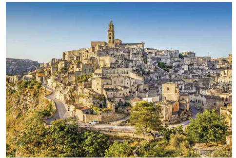
Sassi di Matera