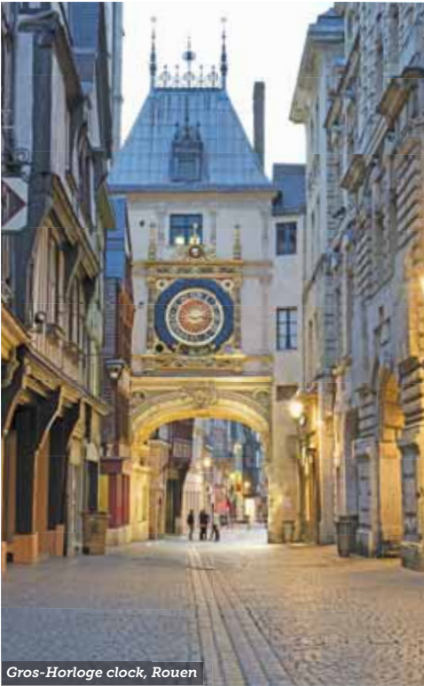
Gros-Horloge clock, Rouen