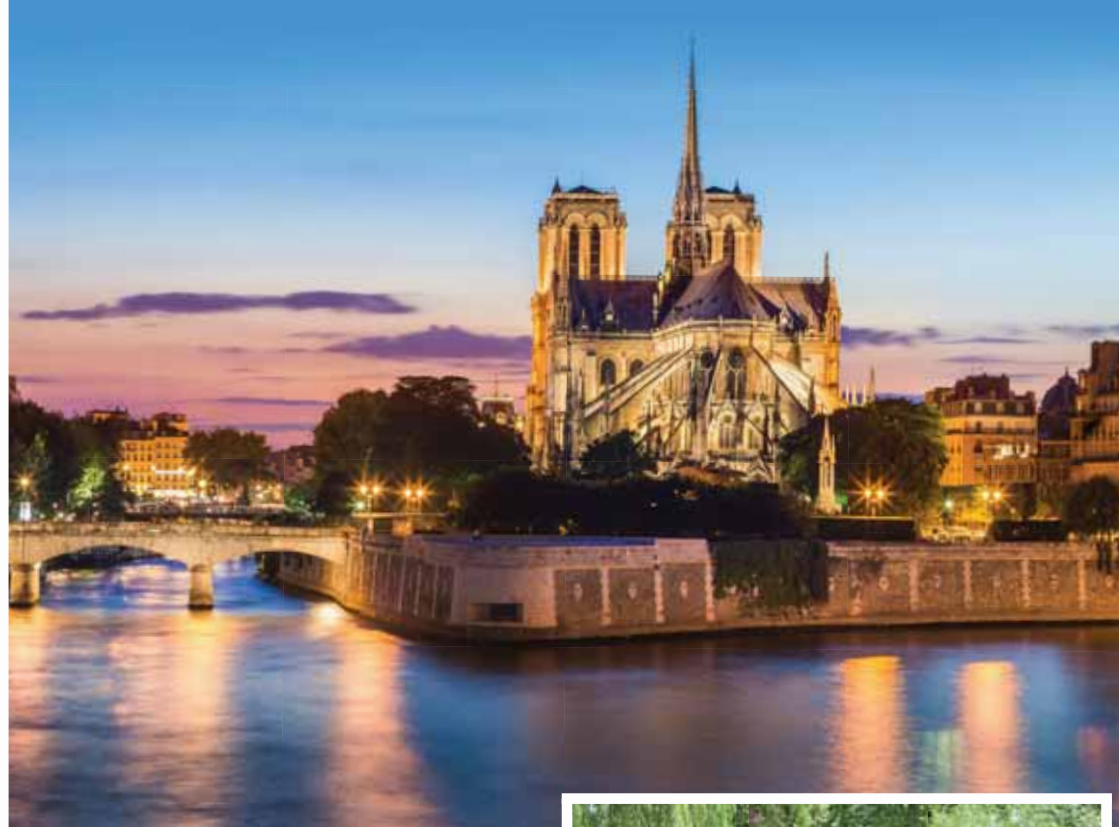
Above: Cruising the Seine at night | Right: Monet's Garden, Giverny