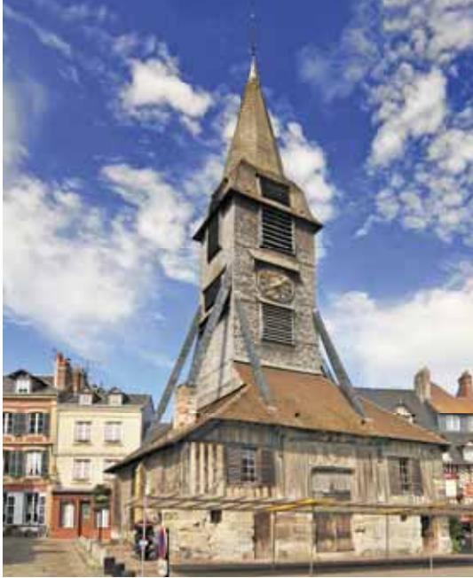
Left: Church of Sainte-Catherine, Honfleur Below: Hall of Mirrors, Versailles | Lower: Abbey de Jumièges