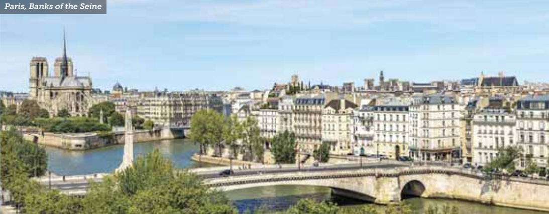
Paris, Banks of the Seine