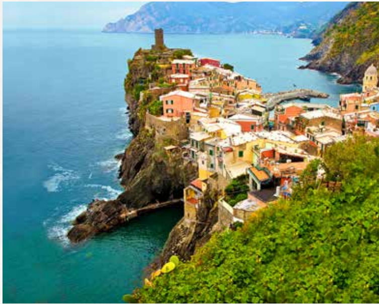
Cinque Terre, Italy

Cruise for seven nights from Barcelona to Rome aboard the exclusively chartered, Five-Star, small ship LE JACQUES CARTIER , featuring the extraordinary Blue Eye , the world's first multisensory, underwater Observation Lounge. Enjoy the sun-drenched landscapes and lush, mountainous backdrops of the French and Italian Riviervas and islands, a glamorous retreat for artists, writers, nobility and gourmands. This unique, comprehensive itinerary immerses you in the region's dynamic history, stunning scenery, inimitable art and culture, and features up to five UNESCO World Heritage sites, including Carcassonne's medieval fortifications and the picture-perfect cliffside villages of Italy's Cinque Terre . Explore Corsica's fortified town of Bonifacio . Choose to visit the Renaissance treasures of Florence or the Tuscan cities of Pisa and Lucca . Along the Côte d'Azur, enjoy a specially arranged excursion in alluring Monaco , the epitome of Riviera chic and home of St. Nicholas Cathedral, where Princess Grace is interred; walk the vibrant Vieux Port in historic Marseille; and explore charming Nice. Barcelona Pre-Cruise and Rome Post-Cruise Options available.