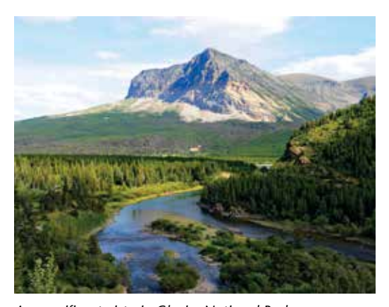
A magnificent vista in Glacier National Park

Day 10: Banff Our last full day in the Canadian Rockies begins with a ride aboard the Banff Gondola to the top of Sulphur Mountain, so named for the hot springs on its lower flank. This 8,000-foot peak overlooking the town of Banff affords stunning mountain views in every direction; indeed, we can see six mountain ranges during this excursion. Then we travel Tunnel Mountain Road to visit two more natural wonders: the Hoodoos, a collection of eroded limestone spires strung along a wooded hillside; and Bow Falls, a wide waterfall just outside Banff. The afternoon is free to explore Banff before we celebrate our outdoor adventures with a farewell dinner at our hotel. B.D