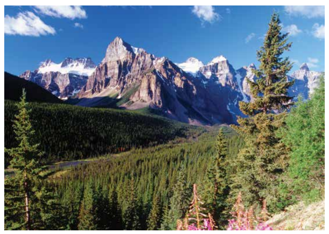
Five national parks sit within the Canadian Rockies.

winding mountain pass that offers breathtaking views and hair-raising turns. After time for lunch on our own we meet up with our motorcoach and continue southwest across the Continental Divide. After arriving late this afternoon in the resort town of Whitefish, Montana, we dine together tonight. B , D