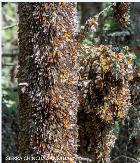
SIERRA CHINCÚA SANCTUARY

Please note that during site visits, the days entail walking around the butterfly sites on your own and photographing and watching butterflies. Please be prepared to be independent during butterfly watching. Bathroom access is at the base of the mountain and can be reached by walking or renting a horse. There are also vendors at the base selling food, beverages, and local crafts. Dressing in layers is important due to weather at mountain elevations.