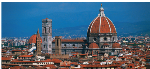
The revered Duomo in Florence