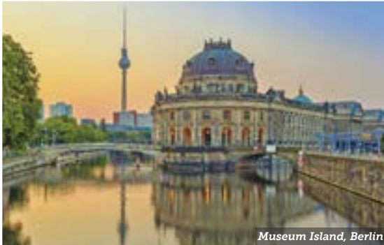
Museum Island, Berlin