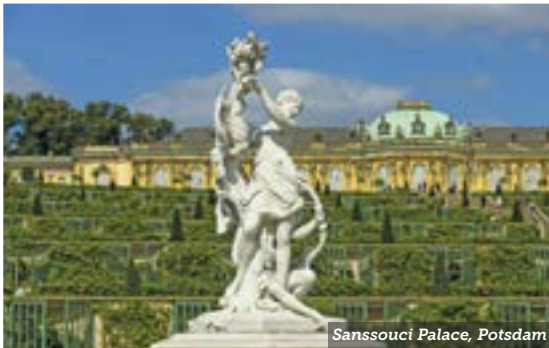
Sanssouci Palace, Potsdam