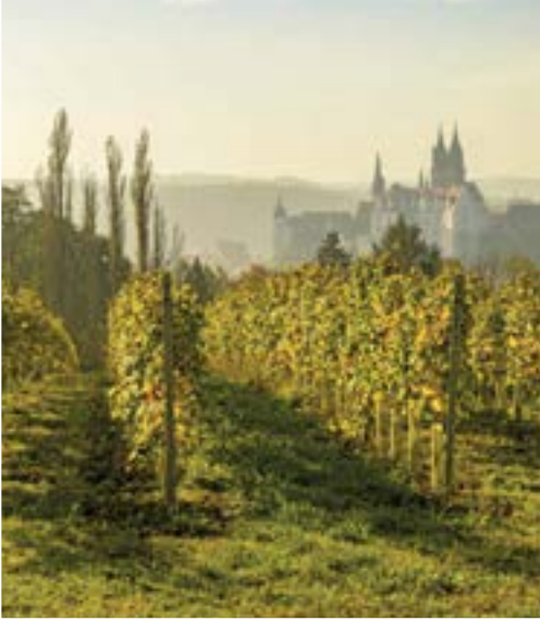
Left: Vineyards near Meissen | Below: Brauhaus Brewery, Wittenberg | Lower: Charles Bridge, Prague