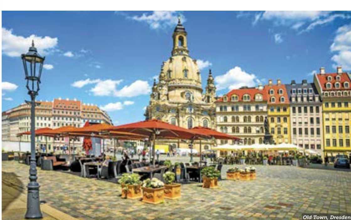
Old Town, Dresden

Golden Lane, lined with charming, 16th-century homes once occupied by the castle's staff.