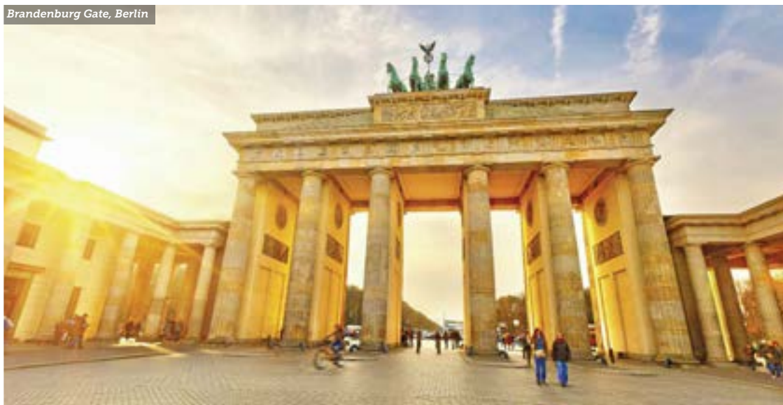
Brandenburg Gate, Berlin