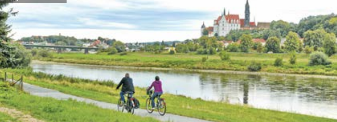
Elbe Cycle Route, Meissen

• Dresden City Tour. On a panoramic tour, see the three stately castles near the Elbe, the "Blue Wonder" steel bridge from 1893 and the chic Koenigstrasse. With a guide, walk to view the baroque Zwinger, the Royal Castle and Dresden Cathedral. Admire the Church of Our Lady, built in 1743 and ravaged by World War II bombings,