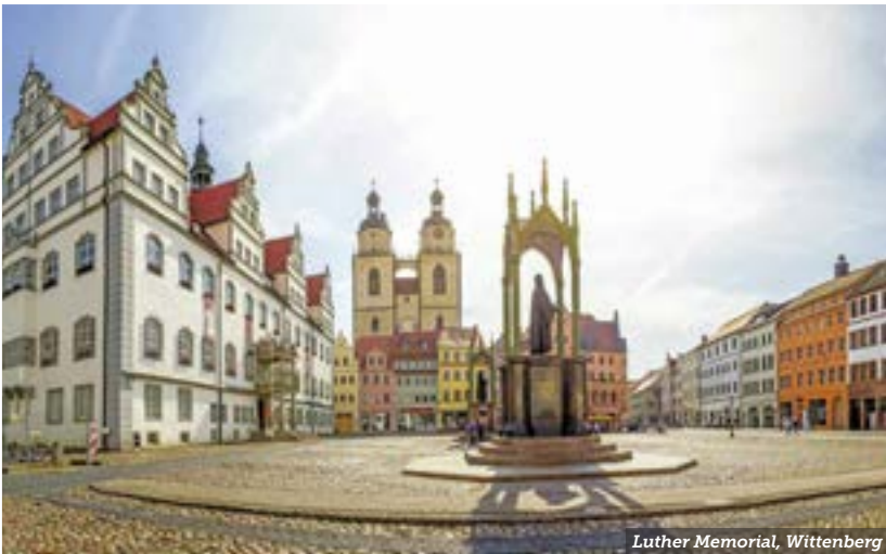
Luther Memorial, Wittenberg