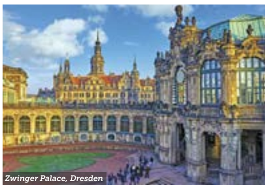
Zwinger Palace, Dresden