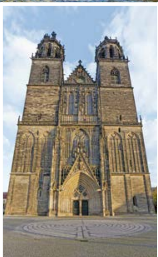
Above: Berliner Dom, Spree River, Berlin | Inset: Germany's first Gothic cathedral, Magdeburg

• Wittenberg and Brewery Tour. Following the tour in town, discover how the Brauhaus brewery creates its beers and enjoy a tasting. (Active – Three floors and many stairs)