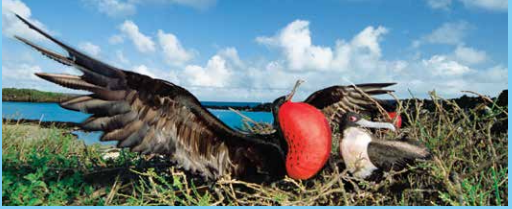
The magnificent male frigatebird is known for its unique mating “dance.”

home to the famous flightless cormorant, sea lions, Galápagos penguins, marine iguanas and pelicans. Explore how recent volcanic activity has reshaped the island’s topography, creating an ever-changing environment for the thriving species found nowhere else.