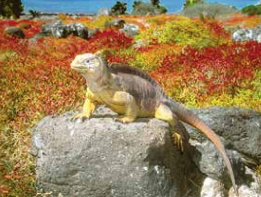
Walk in Darwin's footsteps and observe species endemic to these islands, like the Galápagos land iguana.

RESPONSIBILITY: Trustees of Tufts University, The Tufts University Alumni Association, Tufts Travel-Learn Program, and Gohagan & Company, and its and their employees, shareholders, subsidiaries, affiliates, officers, directors or trustees, successors, and assigns (collectively "Gohagan"), do not own or operate any entity which is to or does provide goods or services for your trip including, for example, lodging facilities, airline, vessel, or other transportation companies, guides or guide services, local ground operators, providers or organizers of optional excursions, food service or entertainment providers, etc. All such persons and entities are independent contractors. As a result, Gohagan is not liable for any negligent or willful act or failure to act of any such person or entity or of any other third party.