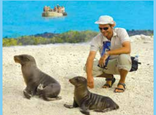
Take photographs of a lifetime during up-close encounters with Galápagos wildlife.

Please note that the itinerary and cruise pattern are dependent on weather, sea conditions and Galápagos National Park Service regulations.