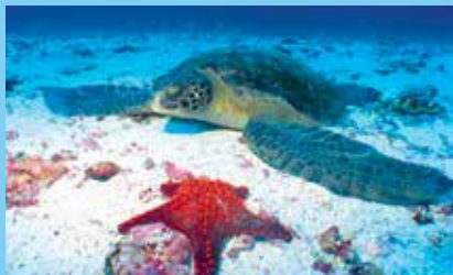
Look for sea stars and sea turtles while snorkeling in the crystal clear waters.

Darwin noted that life in the Galápagos Islands is comprised of mostly "aboriginal creations, found nowhere else." He hypothesized that these species survived by independent evolution; separated from the mainland and with few natural predators, they were able to thrive and adapt in unusual manners. This is why Galápagos wildlife never developed a fear of humans and still allow close encounters—making your journey an intimate and unforgettable experience.