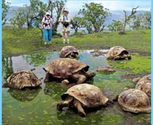
Observe giant tortoises on Isabela Island.

Cruise through the Bolivar Channel, showcasing the stunning volcanic peaks of Isabela and Fernandina. Spend the morning at seahorse-shaped Isabela, a younger island formed by six shield volcanoes. On the arid shore you may encounter the largest land iguanas in the Galápagos as well as giant tortoises and flightless cormorants. Snorkel off Punta Vicente Roca or search the northern shores for Nazca boobies, Darwin's finches and penguins.