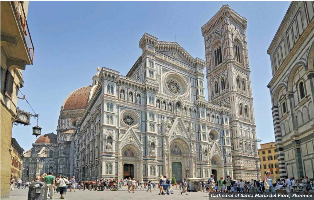
Cathedral of Santa Maria del Fiore, Florence