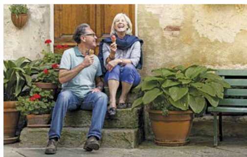
Top: Montepulciano | Above: Enjoying gelato