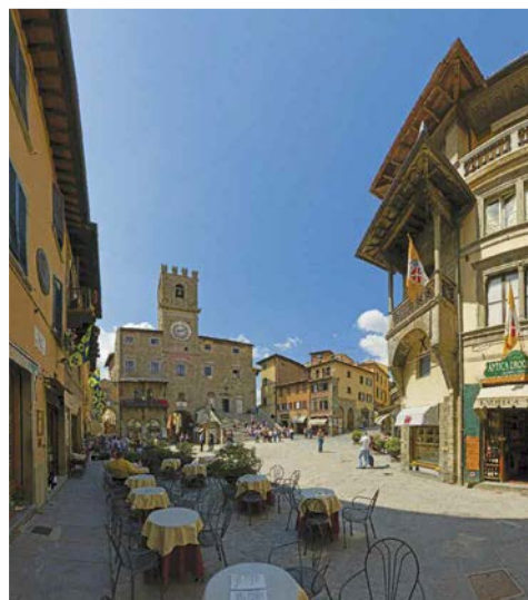
Right: Piazza della Repubblica, Cortona

Free Time: Explore the wonders and cuisine of Florence at your own pace. Uncover the hallowed halls of famous museums, including the Uffizi or the Galleria dell'Accademia, home to Michelangelo's David. You may wish to see the Basilica di San Lorenzo, Florence's oldest church and the resting place of all of the principal members of the Medici family.