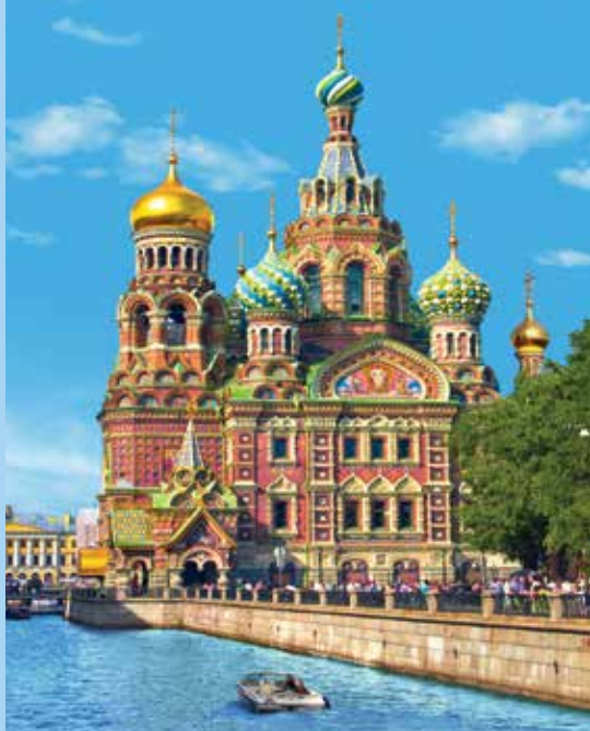
St. Petersburg's Church of the Resurrection of Christ is a showcase of neo-medieval Russian architecture.