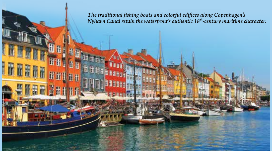
The traditional fishing boats and colorful edifices along Copenhagen's Nyhavn Canal retain the waterfront's authentic 18 th -century maritime character.

In 1980, shipyard workers led by Lech Wałęsa founded the Solidarity movement, the first independent trade union in Eastern Europe and key to winning Poland's struggle against Communism.