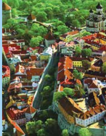
Tallinn, a hub of culture and commerce, is home to 600-year-old Gothic spires and gables.

where landmarks are scattered across more than 40 islands linked by more than 300 bridges. See exquisite examples of Russian Baroque and neoclassical architecture along the main thoroughfare, Nevsky Prospekt; the ornate Church of the Savior on Spilled Blood (Church of the Resurrection of Christ), built on Emperor Alexander II's assassination site; and the 19 th -century St. Isaac's Cathedral, whose striking golden dome crowns the city's skyline.