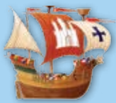
Hanseatic Cog Ship