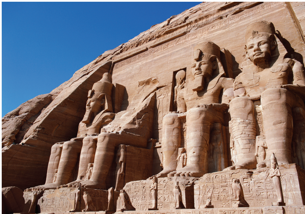
The magnificent temples at Abu Simbel commemorate Ramses II and his queen, Nefertari.