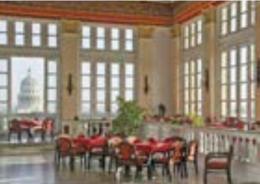
HOTEL MERCURE SEVILLA | HAVANA

Our travel experts have selected these first-class properties, each in a prime location, for your comfort. Details in the design and décor celebrate the local culture and enhance the ambience of each hotel. Their restaurants feature menus of elegantly prepared local and international cuisine. Of utmost importance is the quality of the services, amenities and accommodations, allowing you to maximize the enjoyment of your stay.