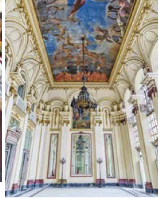
Left: School children, Havana | Above: Museo de la Revolución

Discovery: Revolutionary & Cultural Cuba . Cuba's museums offer insight into the country's unique political and revolutionary history. There are also museums dedicated to