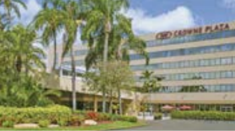
CROWNE PLAZA MIAMI INTERNATIONAL | MIAMI