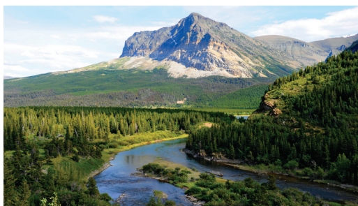
A magnificent vista in Glacier National Park

On this program, we expect a Tufts faculty host to join you to present lectures and lead discussions. However, if due to low enrollment it is not possible to send a Tufts lecturer along, please be assured that our partners at Odysseys Unlimited share our belief that travel should provide an opportunity to learn about the world around us in a deep and meaningful way. We are confident that they will provide you the learning opportunities we know our travelers cherish.