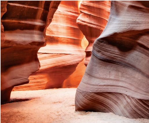
We explore sinuous Antelope Canyon on Day 4.

On this program, we expect a Tufts faculty host to join you to present lectures and lead discussions. However, if due to low enrollment it is not possible to send a Tufts lecturer along, please be assured that our partners at Odysseys Unlimited share our belief that travel should provide an opportunity to learn about the world around us in a deep and meaningful way. We are confident that they will provide you the learning opportunities we know our travelers cherish.