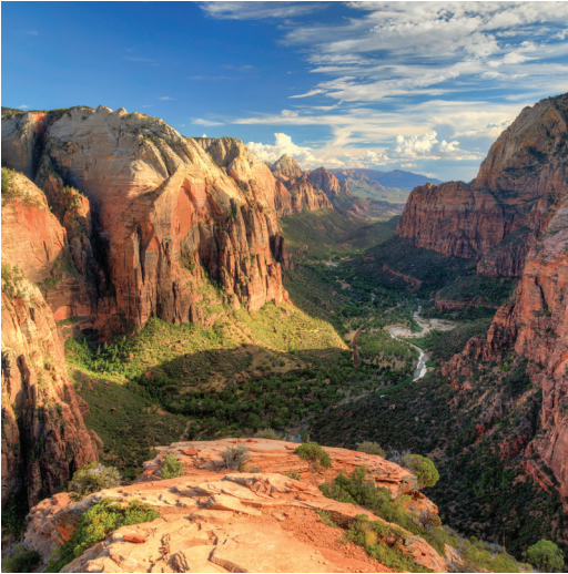
Beautiful Zion vista

Day 10: Depart Las Vegas This morning we transfer to the Las Vegas airport for our flights home. B