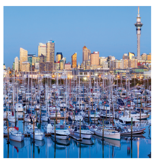
Auckland, City of Sails

Day 16: Depart for U.S. We depart this morning for the airport and our return flights home. B