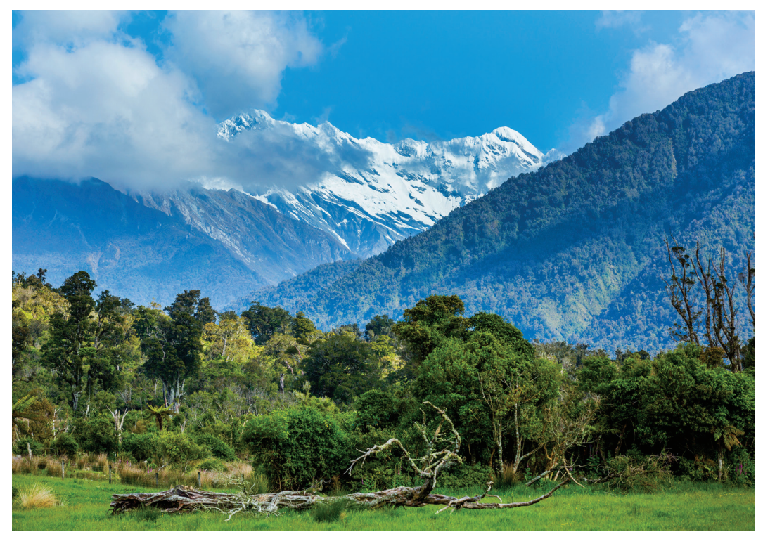
We spend two nights near splendid Westland Tai Poutini National Park.

Reaching Napier after lunch, we embark on a guided walking tour of the city's 1930s Art Deco architecture. After an earthquake leveled the city in 1931, it was rebuilt in "Deco" style; today, Napier ranks as one of the most authentically Art Deco cities in the world. Dinner tonight is on our own. B , L