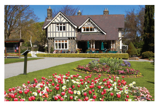
We tour Christchurch's Botanic Gardens on Day 10.

On this program, we expect a Tufts faculty host to join you to present lectures and lead discussions. However, if due to low enrollment it is not possible to send a Tufts lecturer along, please be assured that our partners at Odysseys Unlimited share our belief that travel should provide an opportunity to learn about the world around us in a deep and meaningful way. We are confident that they will provide you the learning opportunities we know our travelers cherish.