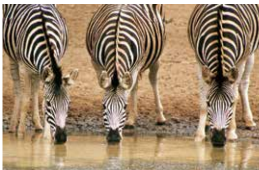
Getting comfortable ...

On this program, we expect a Tufts faculty host to join you to present lectures and lead discussions. However, if due to low enrollment it is not possible to send a Tufts lecturer along, please be assured that our partners at Odysseys Unlimited share our belief that travel should provide an opportunity to learn about the world around us in a deep and meaningful way. We are confident that they will provide you the learning opportunities we know our travelers cherish.