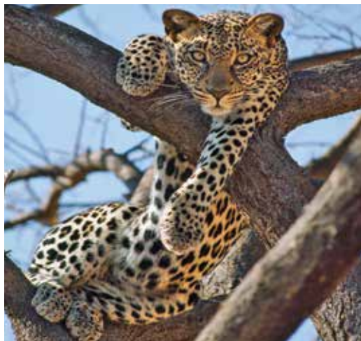
Zebra roam freely in Chobe National Park.

Day 14: Arrive U.S. We arrive in the U.S. this morning and connect with our flights home.