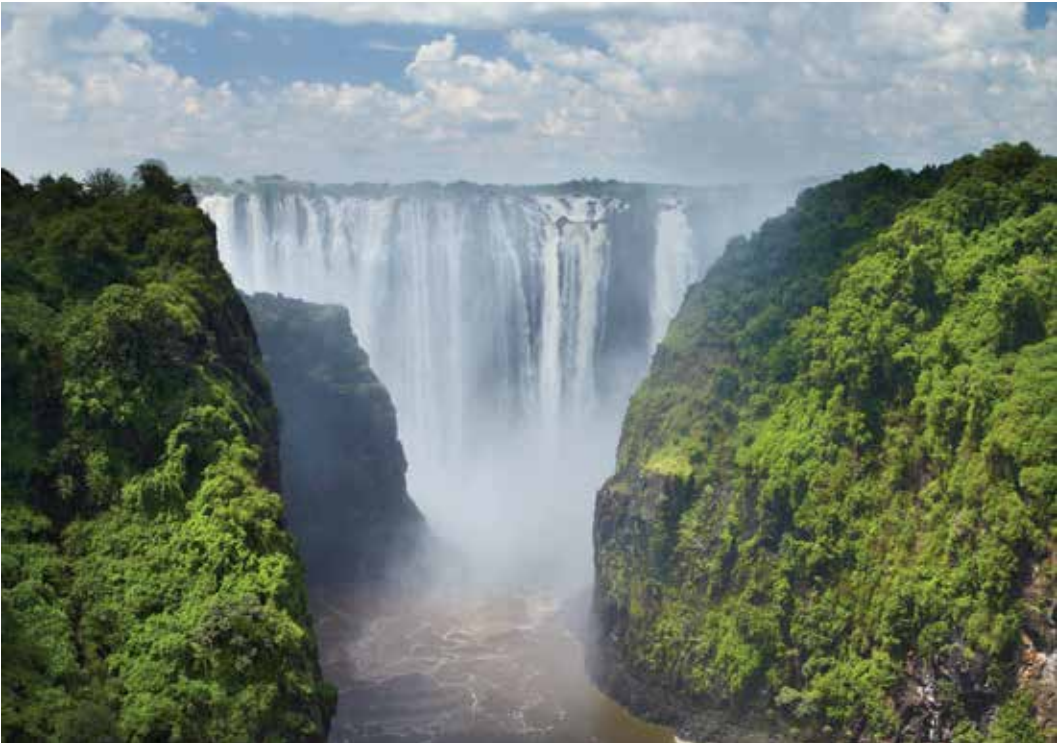
Known as the “Smoke that Thunders,” Victoria Falls is one of the wonders of the natural world.

River, where we may see hippo, crocs, and some of the park’s 450 species of birds (including the sacred ibis, carmine bee-eaters, fish eagles, and kingfishers). We dine tonight at our lodge. B,L,D