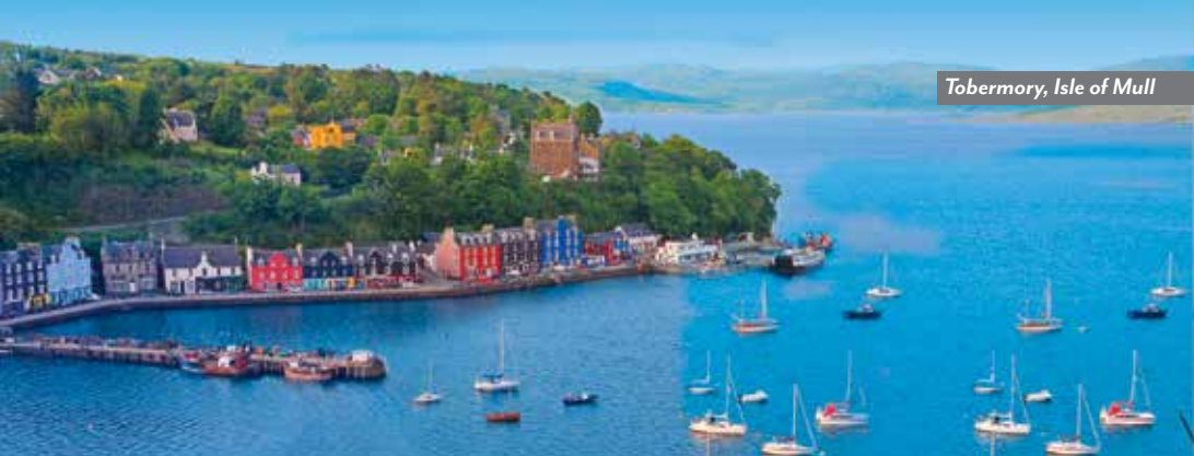
Tobermory, Isle of Mull

of the D-Day operations and Sir Winston Churchill's role in its undertaking.