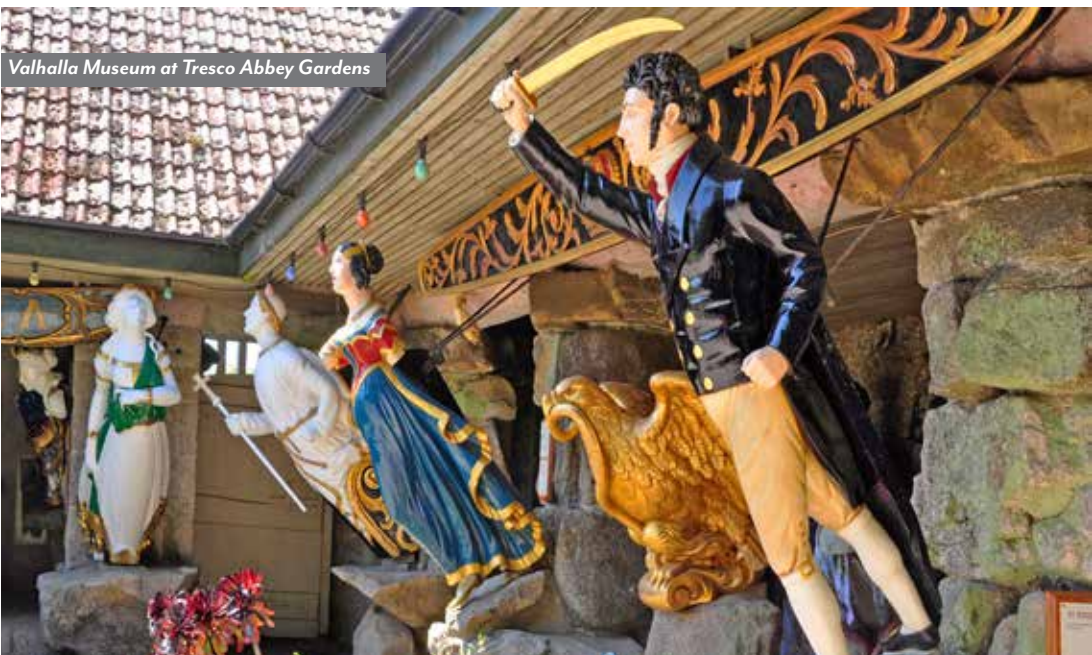
Valhalla Museum at Tresco Abbey Gardens

Following breakfast, disembark and continue on the Post-Program Option or transfer to the airport for your return flight home.