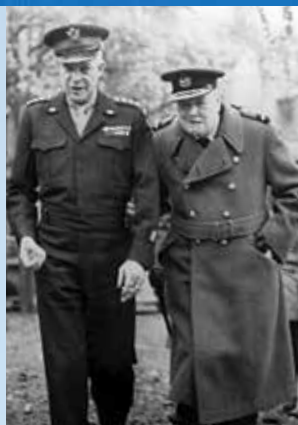
President Dwight D. Eisenhower with Winston Churchill

Following graduation, he served in the United States Naval Reserve for three years as an officer on the USS Albany; shortly afterward, he earned his J.D. cum laude from The George Washington University Law School. Today, Eisenhower is Senior Fellow of the Foreign Policy Research Institute and a Public Policy Fellow at the Annenberg School of Communication and the School of Arts and Sciences at the University of Pennsylvania, where he teaches “Communication and the Presidency.”