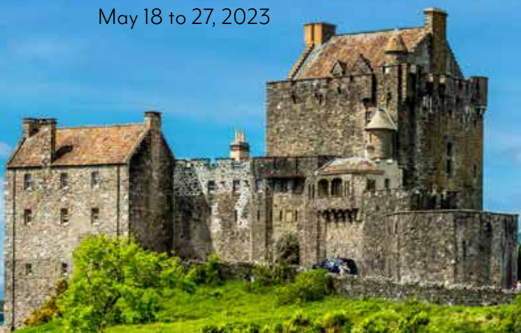
Eilean Donan Castle