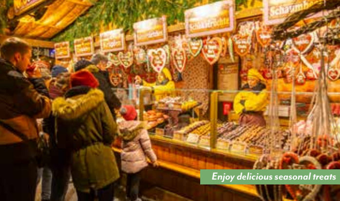
Enjoy delicious seasonal treats