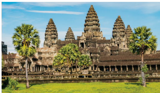
Angkor Wat (post-tour extension)

Day 15: Depart for U.S. Today we transfer to the airport for our return flights to the U.S. B