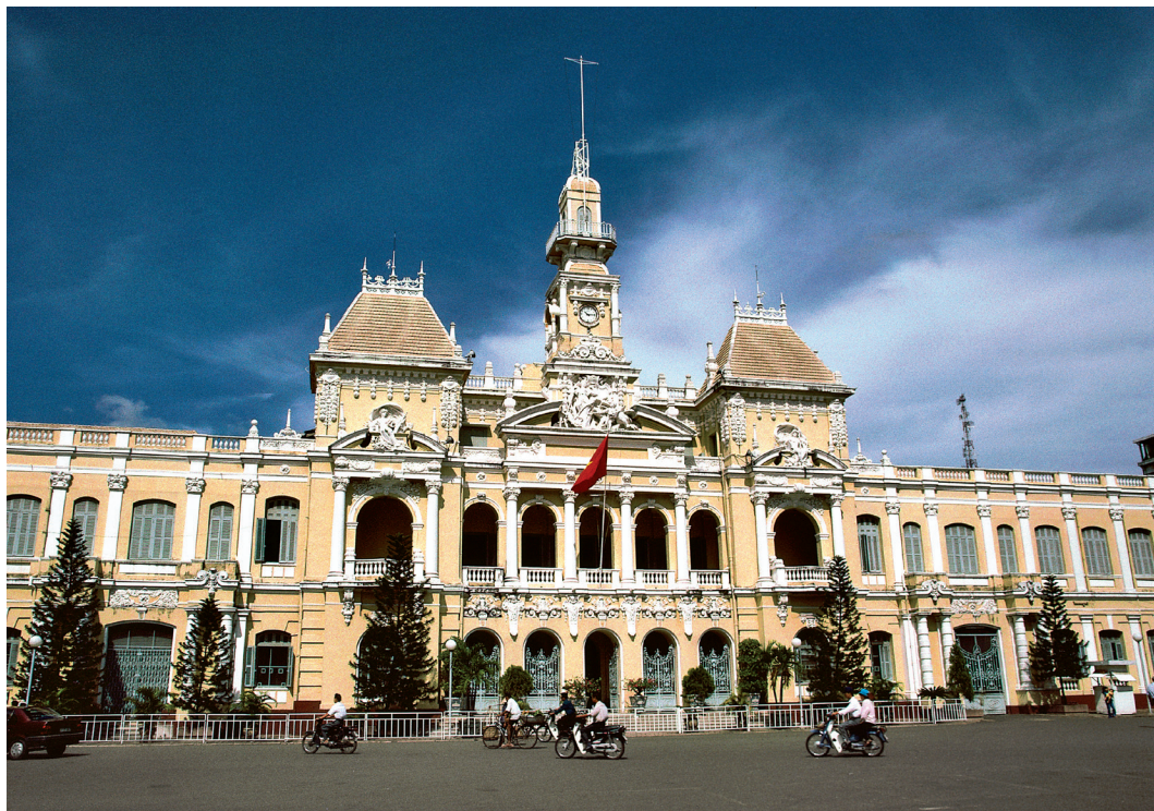
Observe the French architectural influences during a tour of Saigon on Day 13.

resort for a relaxing interlude. Tonight, we enjoy a cooking lesson and dinner in Hoi An. B,D