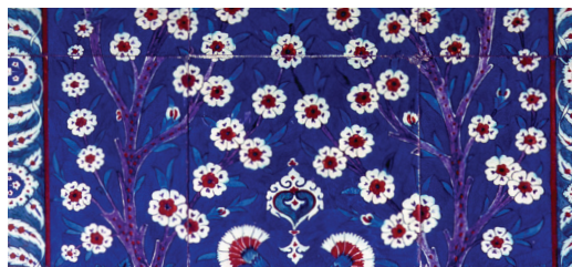
Exquisite Iznik tiles

Day 14: Antalya/Perge This morning we tour the ruins at Perge, an ancient Greek city once among the world’s prettiest and most prosperous. We also visit the Duden Waterfalls, which tumble about 130