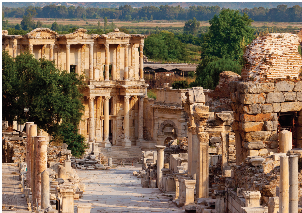
Ruins at Ephesus

Day 6: Istanbul/Gallipoli/Troy/Assos Leaving Istanbul this morning, we travel to the northern Aegean Coast for a brief visit to Gallipoli, haunting site of 31 Allied cemeteries from World War I. Then we ferry across the Dardanelles to Troy, once believed to exist only in Homer’s epic poem until the present site was discovered in the 1870s. After touring here we continue south to Behramkale, ancient Assos, where we spend the night. B,L,D