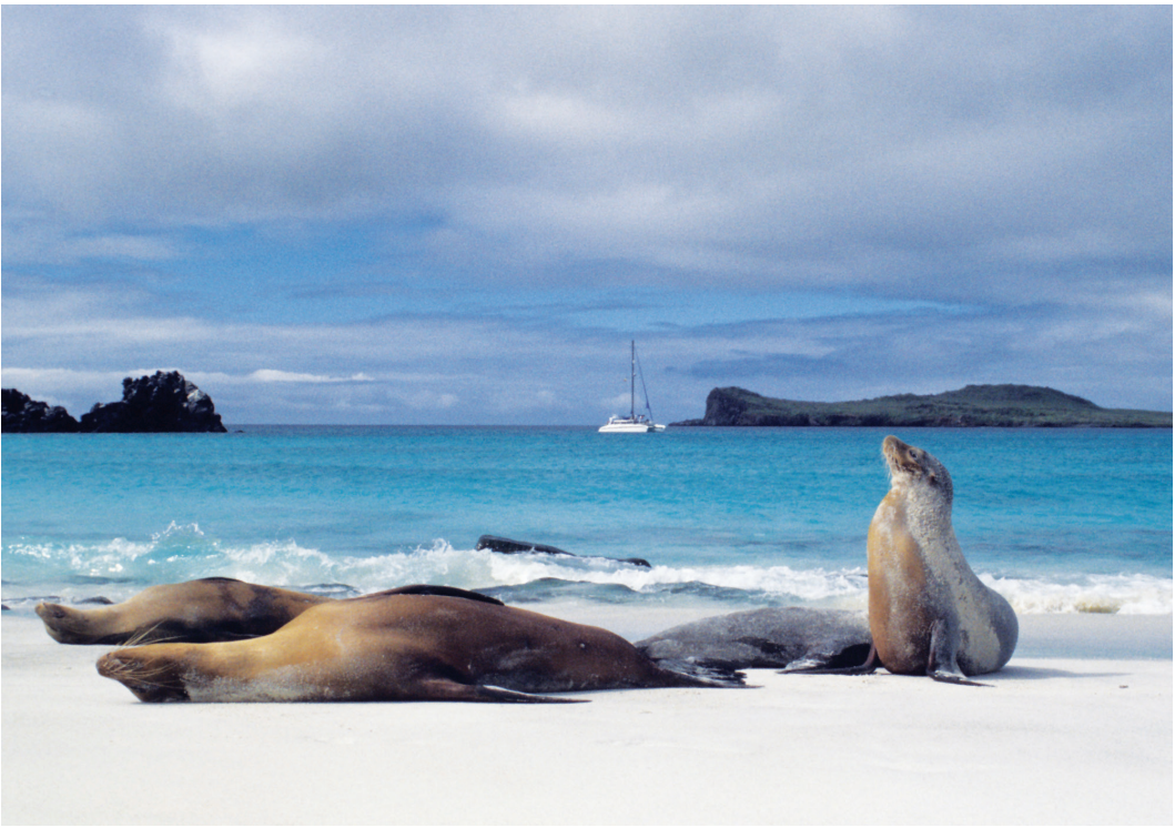
We encounter plenty of wildlife, like these sunbathing sea lions, in the Galapagos.

of the Americas and the continent’s oldest continuously inhabited city. This morning we tour this UNESCO site then stop at the ruins of Sacsayhuaman fortress, a masterpiece of Incan architecture. We enjoy lunch today at a local restaurant. B,L