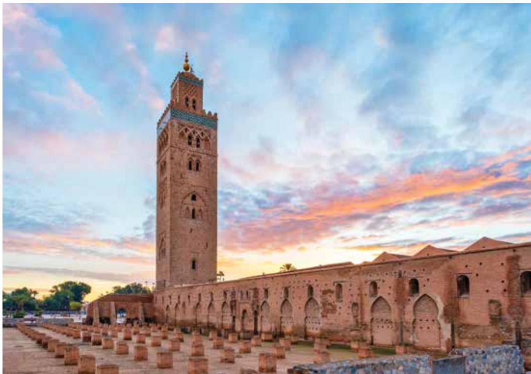
We see the distinctive Koutoubia Mosque – Marrakech’s largest – on Day 11.

Day 6: Fez We begin today with a walk through the medina and a visit to the Al-Attarine Madrasa, whose highlight is a small courtyard showcasing intricately detailed tilework and carving decorations. Then we embark on a walking tour of the medina focusing on the artisans’ quarters, the 14 th -century Koranic schools, and Al Karaouine, the medieval theological university. After lunch on our own, we visit the Borj Nord Arms Museum, an authentic Saadi fort that dates from 1582 and one of Morocco’s only European-influenced forts. After exploring the Moroccan armaments here, we are free this afternoon for independent exploration or relaxation. Tonight, we enjoy a private dinner at an intimate family-run riad in Fez. B,L,D