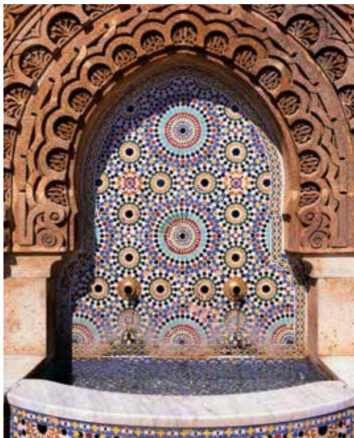
Traditional Moroccan tile work

Day 10: Ouarzazate/Ait ben-Haddou/Marrakech En route to Marrakech today, we stop first at uninhabited Ait ben-Haddou, a UNESCO World Heritage