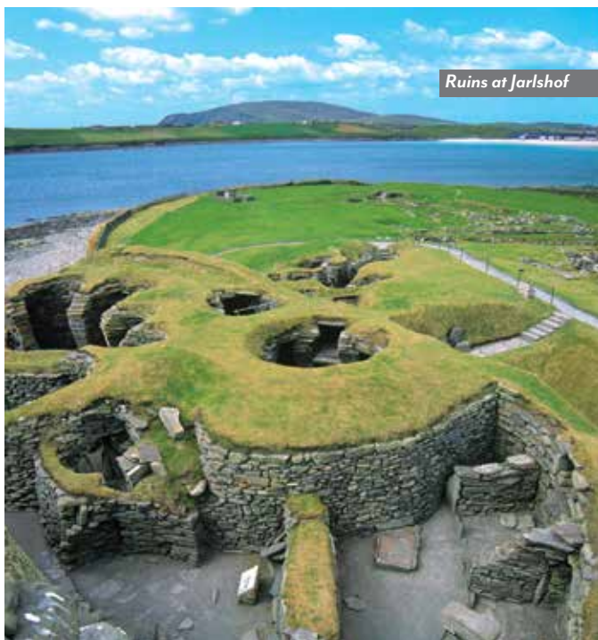
Ruins at Jarlshof

Visit the Neolithic Heartland of Orkney, a UNESCO World Heritage Site, and view the ceremonial Stones of Stenness, the Ring of Brodgar henge, and the nearby site of Ness of Brodgar. Continue to the early Orcadian settlement of Skara Brae, then visit St. Magnus Cathedral, also known as the "Light of the North." Hear the iconic sounds of a Scottish bagpiper as you reboard the ship in Kirkwall. This evening, enjoy a storyteller's amazing performance of traditional Scottish tales.