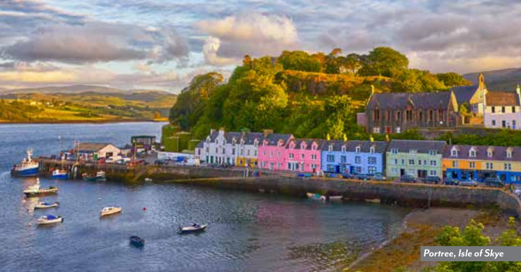
Portree, Isle of Skye

Through the unsurmounted natural beauty of Norway’s mighty fjords and across the mist-enshrouded peaks and hauntingly beautiful glens of Scotland, the legacies of Viking and Celtic clans are entwined in rich traditions and compelling archaeological heritage.