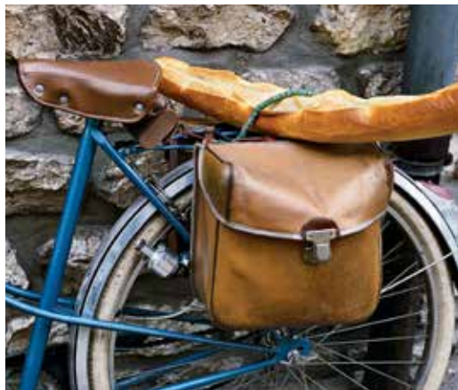
Typical French scene

Day 14: Paris Today we get acquainted with one of the world's greatest cities, seeing the highlights on this morning's city tour, including a guided tour of Musée Rodin, a museum dedicated to prolific French sculptor Auguste Rodin. This afternoon is free for independent exploration; tonight we gather for a farewell dinner to bid “ adieu ” to France. B,D