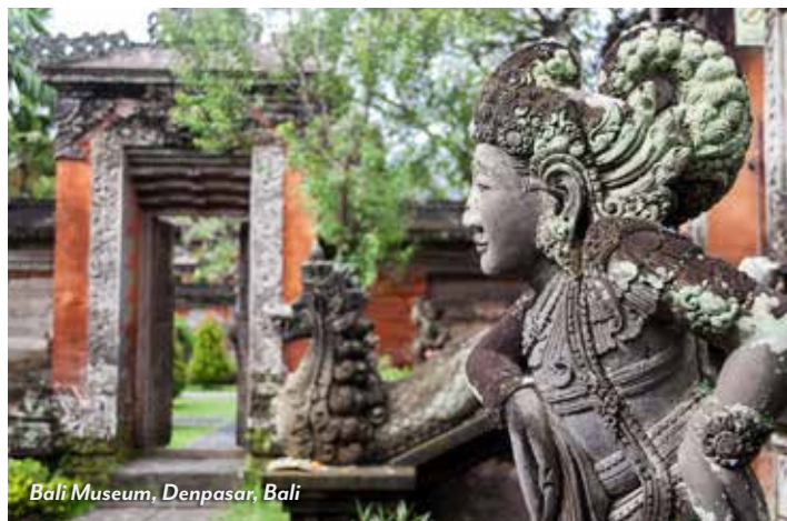
Bali Museum, Denpasar, Bali

carving, and painting to textile design, beadwork, and basketry, Indonesia's visual arts are diverse and plentiful. Here, visit multiple villages to admire silver and gold work, wood carving, and batik making. Marvel at rice terraces en route to lunch in the resort town of