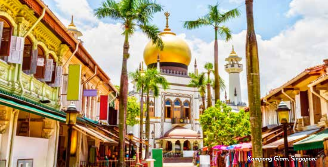
Kampong Glam, Singapore

greatest Buddhist monuments in the world; and Prambanan Temple, the largest Hindu temple in Indonesia with 240 temples in the complex. (Active)