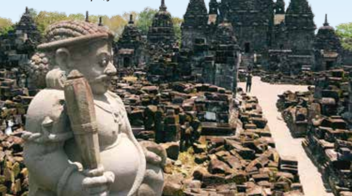
Prambanan Temple, Java

Since ancient times, rulers have built temples to serve as holy places of worship, bring prestige to their kingdoms, and represent wealth and power. In Indonesia, Hindu is the oldest religion, having come from India around the second century, with Buddhism following as the second oldest religion. Buddhist temples symbolize the five elements of wisdom, water, fire, wind, and earth. Hindu temples are often centered around one towering shrine surrounded by a complex of individual temples and bordered by a wall. Borobudur Temple compound is a 8th- and 9th-century Mahayana Buddhist temple situated on a remote hilltop in central Java. Hailed as one of the greatest, and largest, Buddhist monuments in the world and designated a UNESCO World Heritage Site, this monument draws pilgrims from around the world to stand in awe of its elaborate construction and 504 sitting Buddha statues meditating over the holy temple. Also in Java, UNESCO-inscribed Prambanan Temple compound was built in the 10th century and is the largest Hindu temple in Indonesia. Its central Shiva temple, standing at 154 feet, is surrounded by 240 smaller temples. The fact that of Borobudur and Prambanan temples were built in proximity to one another in Java is testament to the idea that Buddhism and Hinduism once coexisted peacefully.