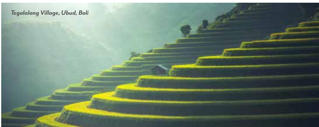
Tegalalang Village, Ubud, Bali

Today, flights arrive in your home city.