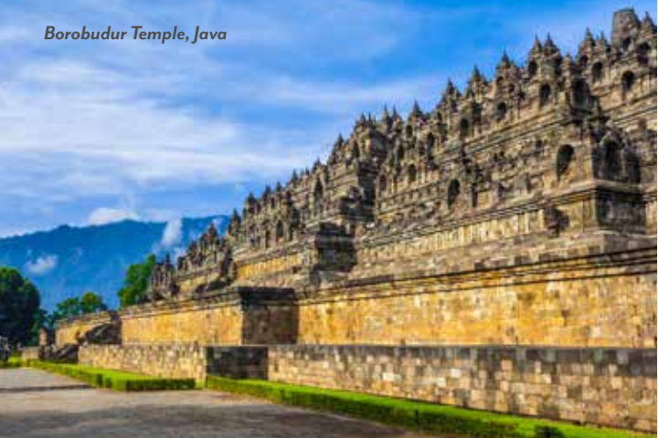
Borobudur Temple, Java