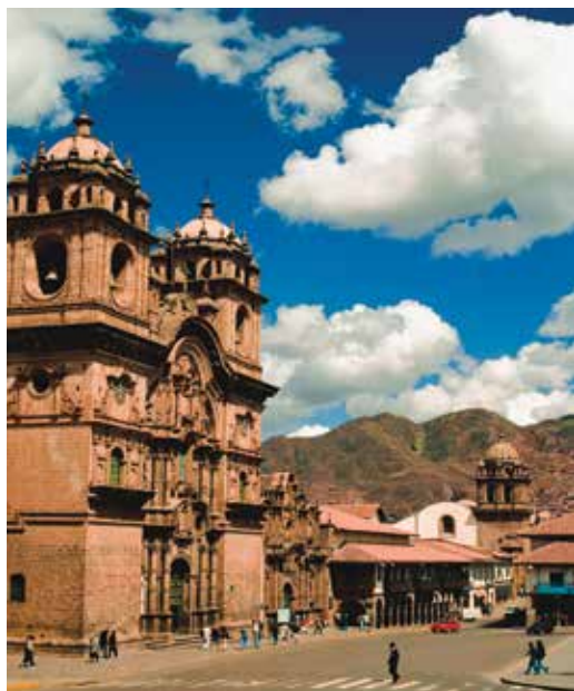
Plaza de Armas, Cuzco

Day 10: Puno/Lima/Depart for U.S. This morning we visit the mysterious burial towers ( chullpas ) at Sillustani over-looking Lake Umayo. After lunch we transfer to the airport for the flight to Lima, where we check into our day rooms at an airport hotel. Late this evening we depart on our flight to the U.S. B,L