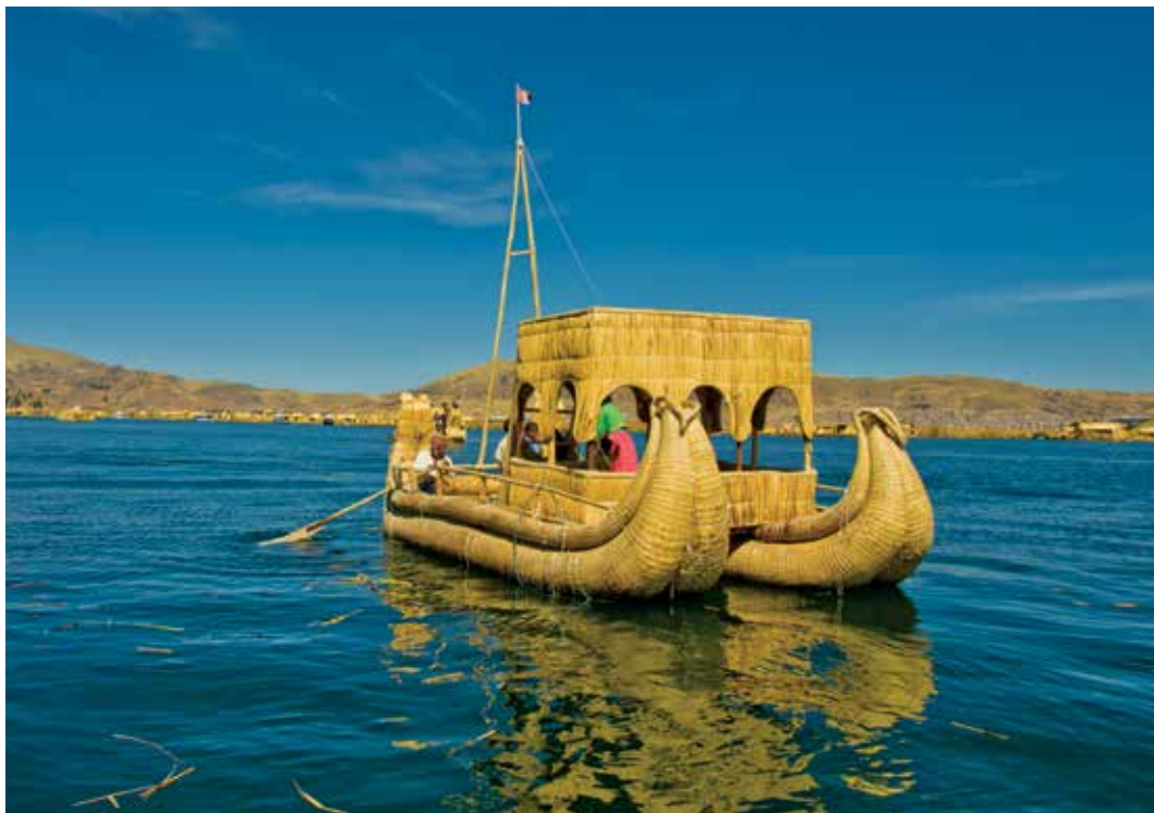
Uros islanders' reed boat sails Lake Titicaca.

Aguas Calientes and our hotel, with time at leisure before dinner together tonight. B,L,D