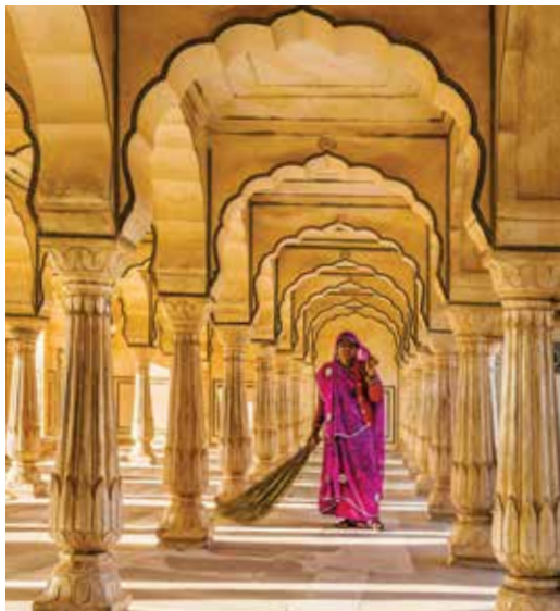
Amber Fort, former Rajput capital

Day 17: Return to U.S. Very early this morning we transfer to the airport for our return flight to the U.S.