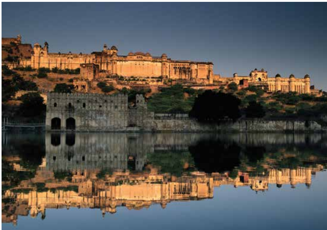
Visit Amber Fort, a UNESCO World Heritage site, on Day 6.

Day 8: Jaipur/Ranthambore We travel today to Ranthambore National Park, the former hunting ground of the Maharajah of Jaipur and now a 512-square-mile natural preserve that is home to hundreds of species of birds, reptiles, mammals, and of course, Bengal tigers. This afternoon we take our first game drive through the park. B,L,D