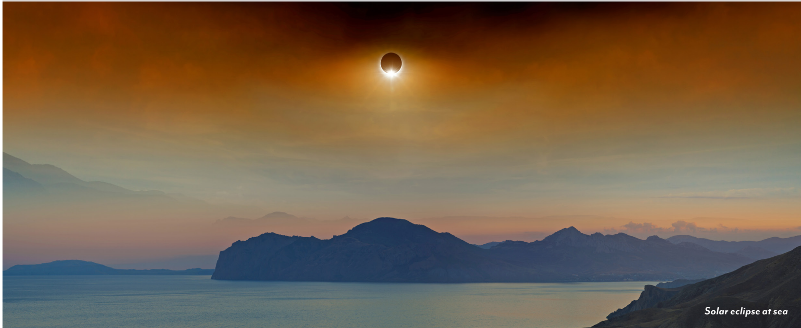
Solar eclipse at sea