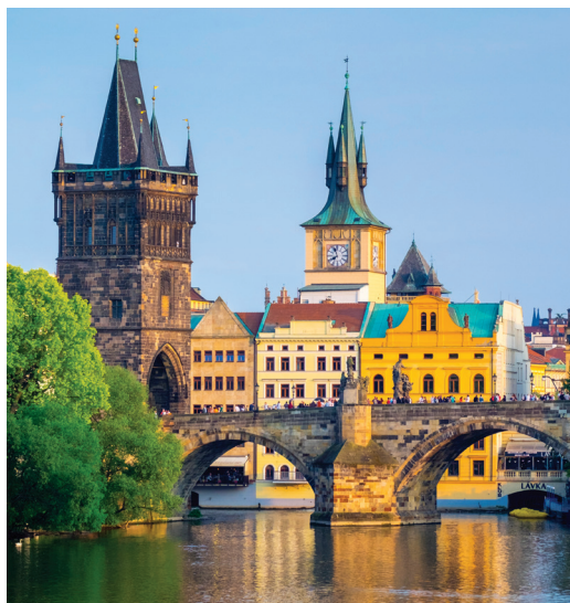
Prague, “City of a Hundred Spires”

Day 15: Prague This morning’s visit to Josefov, Prague’s historic Jewish ghetto, includes the Old