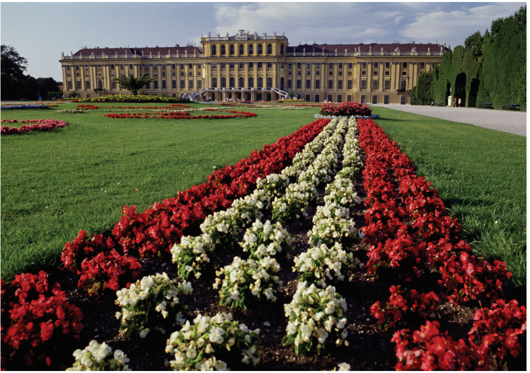
We visit Vienna's majestic Schönbrunn Palace on Day 11.

Day 6: Krakow This morning we tour the Wieliczka Salt Mine, a UNESCO World Heritage site that is a virtual underground city, with galleries, lakes, chapels, and murals – all carved from salt. The mine's centerpiece is the Chapel of Saint Kinga, with its chandelier and mural of The Last Supper , carved by three miners over a period of 68 years. Then we return to Krakow, where the remainder of the day is free for independent exploration, with lunch and dinner on our own in this historic capital. B