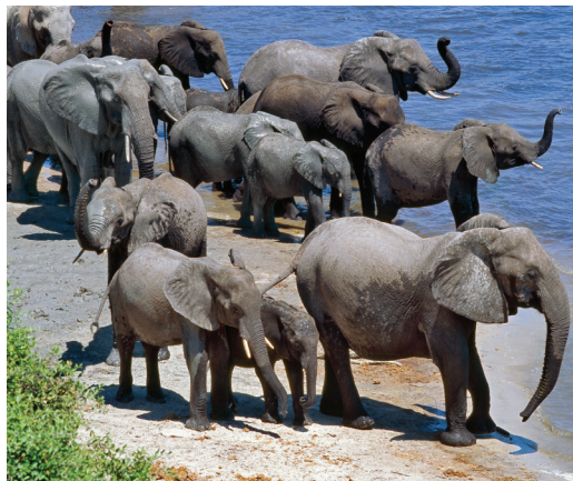
Elephants abound at Chobe.

Day 18: Arrive U.S. We arrive in the U.S. today and connect with our flights home.