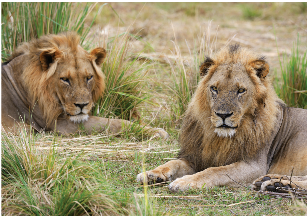
Lions lounging in their natural habitat.

full-day excursion to Chobe, where we take a morning game drive and an afternoon game cruise. B,L,D