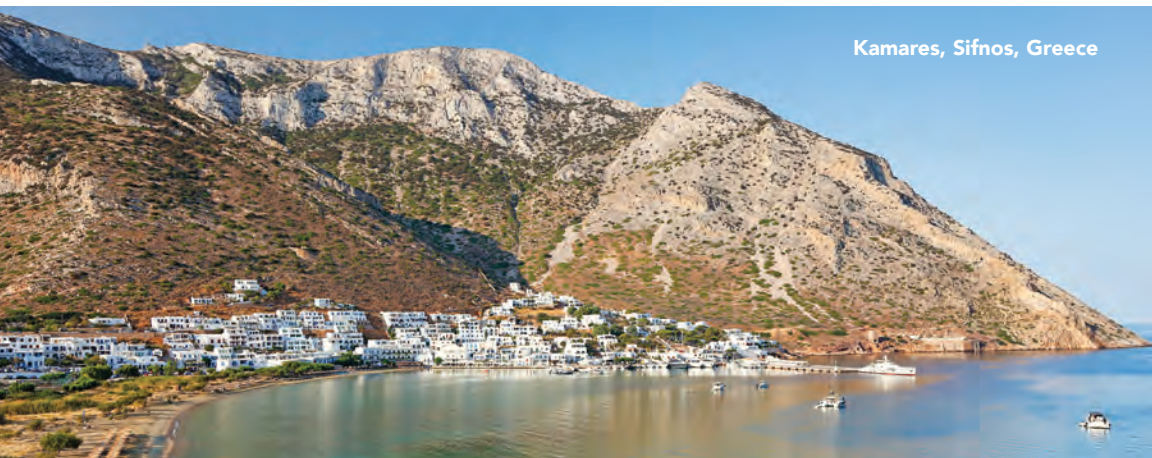
Kamares, Sifnos, Greece

This itinerary is subject to change at the discretion of Tufts University and Arrangements Abroad. For complete details, please carefully read the terms and conditions at www.arrangementsabroad.com/terms .