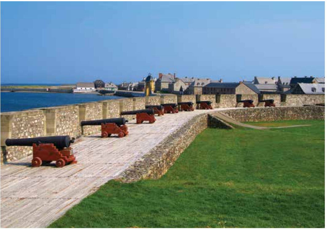
We visit the historic Fortress of Louisbourg on Cape Breton Island.

appreciation for the city's history as we drive along King Street, the steepest main street in Canada; and pass by landmarks including the Loyalist House, one of Saint John's first homes; hilltop Carleton Martello Tower, the fortification that ranks as Saint John's oldest building; and the Old City Market, Canada's longest-running farmer's market. Then we make our way down the coast to St. Andrews-by-the-Sea. From here, we embark on a whale watching cruise in the Bay of Fundy, where we're on the lookout for the bay's 12 species of whales (including humpback, minke, and finback). B,D