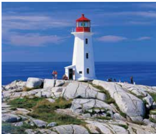
Iconic lighthouse at Peggy’s Cove

Day 12: Depart Nova Scotia We transfer to the Halifax airport today for our flights home. B