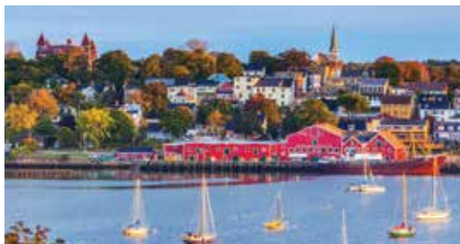
We visit Lunenburg and its scenic harbor on Day 2.