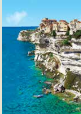
The "Citadel of Cliffs," Bonifacio rock formations are a result of a

meandering coastal boulevard dedicated to the late U.S. president, and historical La Canebière, the high street built by Louis XIV in 1666. See the city's Old Town, majestic 19 th -century Cathédrale de la Major and the Vieux Port (Old Port), often considered Marseille's birthplace. Visit the neo-Byzantine Notre Dame de la Garde with extraordinary views overlooking the city and harbor.