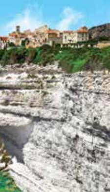
io's rugged limestone ncient volcanic activity.