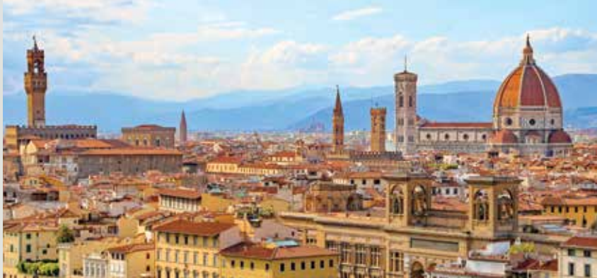
Two medieval symbols of Florence and the Renaissance crown the city's horizon: Palazzo Vecchio and Filippo Brunelleschi's magnificent dome.