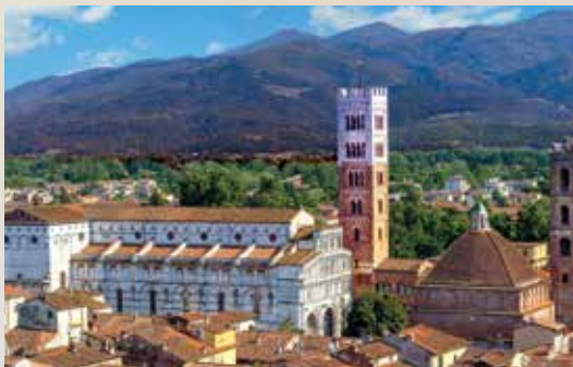
Lucca's sixth-century Cattedrale di San Martino is situated in a secluded part of the old city center.

Cruise by private boat to two of Cinque Terre's picturesque villages. This UNESCO World Heritage site is a series of five colorful fishing villages that cling to remote cliffs overlooking the Ligurian Sea—discover the vivid nuances of