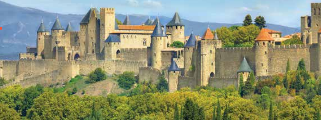
Photo this page: The magnificent ancient-walled city of Carcassonne was settled more than 2000 years ago.

Cover photo: Enchanting Portofino's colorful houses and yacht-ringed harbor are a vision of Italian Riviera charm.