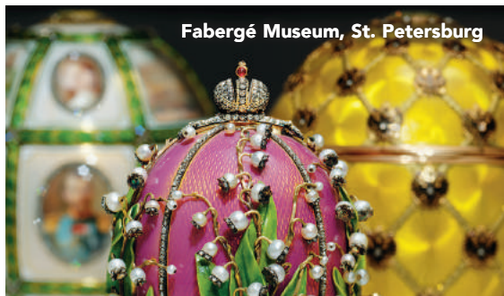
Fabergé Museum, St. Petersburg