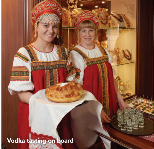
Vodka tasting on board

To reserve a place, please contact Arrangements Abroad at phone: 212-514-8921 or 800-221-1944, or fax: 212-344-7493; or complete this form with your deposit of $1,000 per person (fully refundable until 120 days prior to departure) payable to Arrangements Abroad . Mail to: Arrangements Abroad, 260 West 39th Street, 17th Floor, New York, NY 10018-4424.