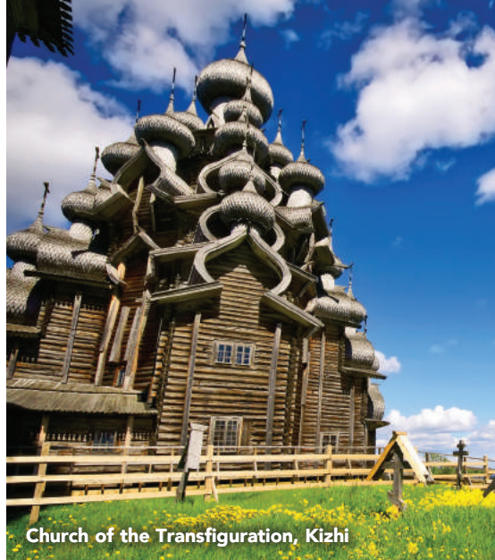
Church of the Transfiguration, Kizhi