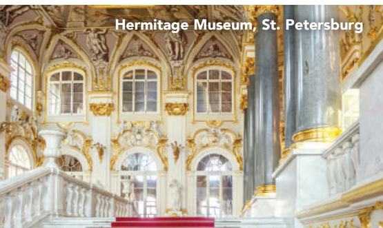
Hermitage Museum, St. Petersburg