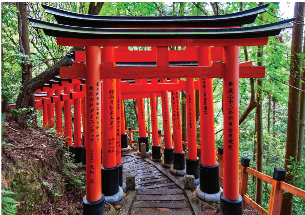
We visit Kyoto's Fushimi Inari shrine on Day 12.

Day 6: Hakone/Takayama Today we travel first by bullet train then by Wide View Hida express train to lovely Takayama in the Japanese Alps, considered one of the country's most attractive towns with its beautifully preserved Old Town. Our explorations center on three narrow streets in the San-machi-suji district where, in feudal times, merchants lived amidst the authentically preserved small inns, teahouses, and sake breweries. This afternoon we attend a traditional Japanese tea ceremony here, an historic ritual of form, grace, and spirituality. B,D