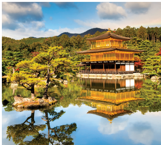
We visit Kyoto’s Temple of the Golden Pavilion on Day 10.

Day 12: Kyoto We continue our encounter with Kyoto today, first at the important Fushimi Inari shrine, with its trails straddled by red torii gates; Sanjusangendo Hall (c. 1266), an important Buddhist